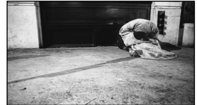
A sidewalk should never need to be a bed.

For more information, please visit the Seattle King County Coalition for the Homeless at www.homelessinfo.org .